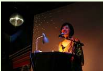
San Diego VAMP

Not only did I perform my solo shows, I also told a story at a super popular storytelling show, VAMP, and performed my comedy set at a clean, clever and really funny comedy show called Comedy Heights. I had a blast at each show and met some amazing people along the way. Each show had its unique vibes. Even within the Fringe, audience reactions varied, making it all the more fascinating.